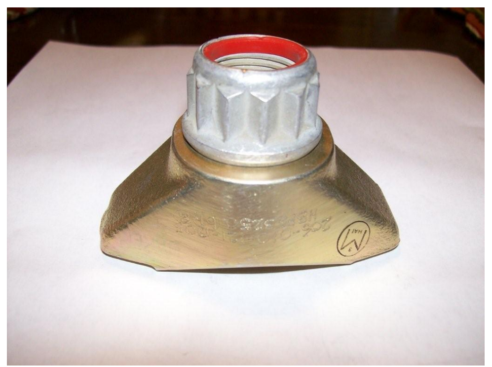
Figure 4: Example Correct Nut as seen with Main Rotor Latch - Note close tolerance fit.