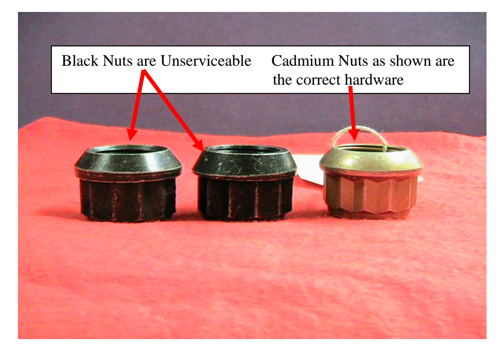
Figure 2: Comparison Non-Conforming MR Nuts with Conforming Nut