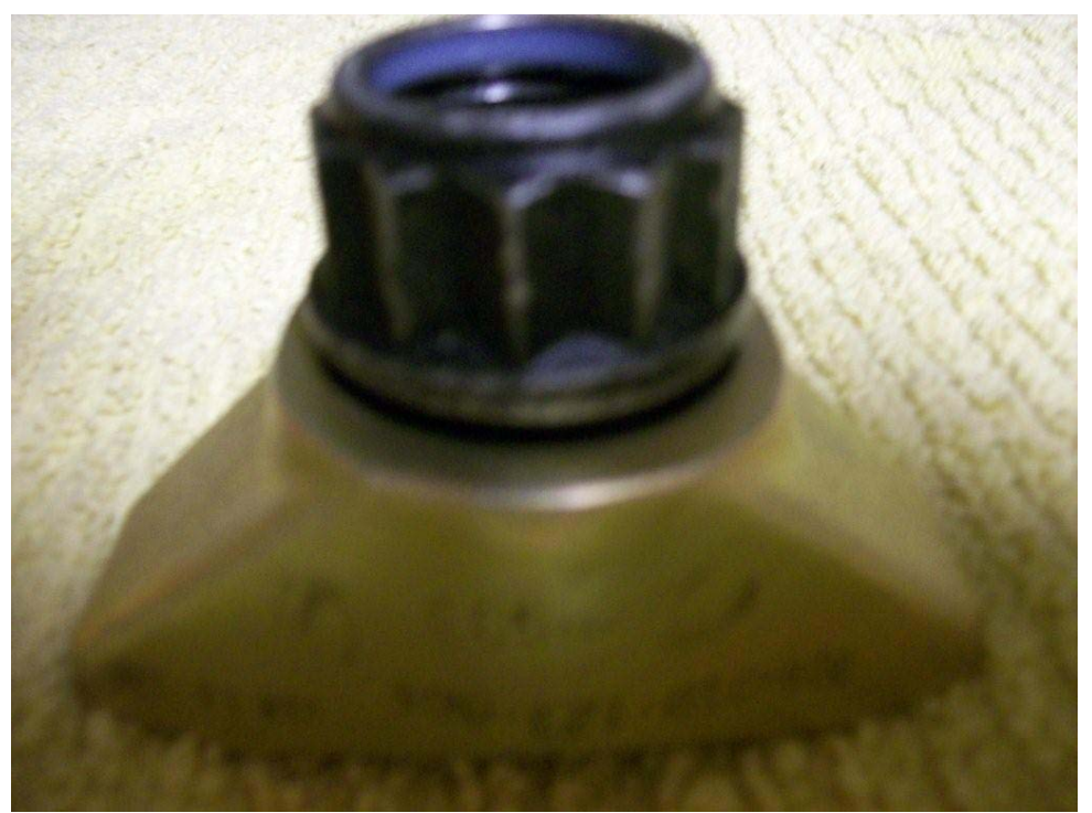
Figure 5: Non-Conforming Nut with Latch, Note Gap between nut and Latch