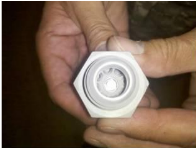
Figure 2: Serviceable