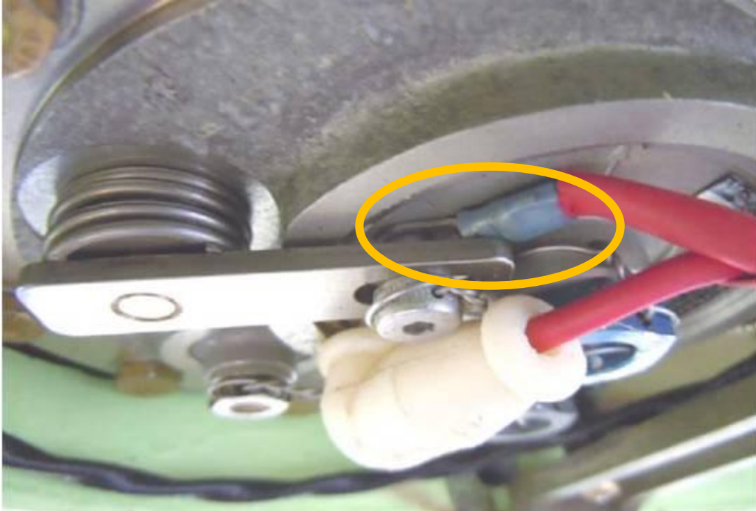
Figure 3: Ground Terminal incorrectly secured under Fuel Inlet Shutoff Valve Arm.