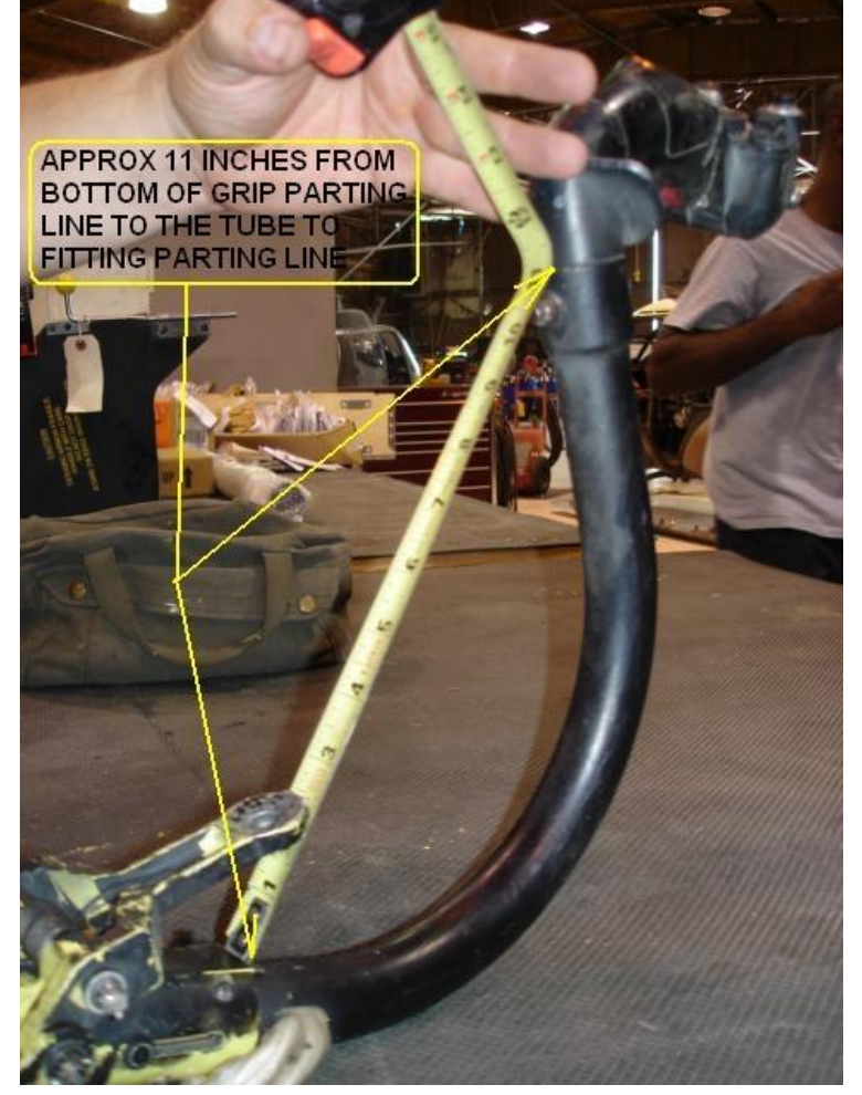
Figure 1 Figure 2 Page 1 of 2

1. Measure Co-pilots Cyclic Control Stick from lower tube fitting line to grip parting line as shown. Length should be approximately 11 inches when measured.